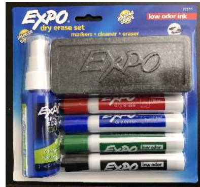
Expo dry erase set: